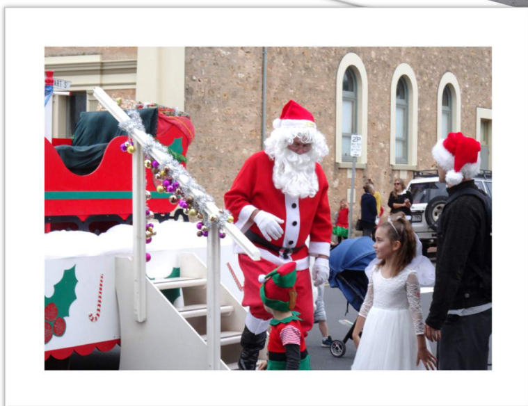
Father Christmas arrives at Grosvenor Gardens to meet the children